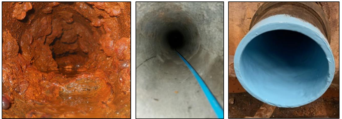
Pictures: Above left, drinking water pipe before cleaning, center, after cleaning with Tomahawk, right, after lining with BluKote<sup>™</sup>.