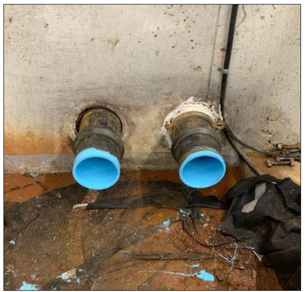
Above, both pipes after lining with BulKote<sup>™</sup> from within the mechanical room.

For more information about the Envirologics suite of pipe rehab technologies, contact us at info@envirologics.ca or 1-800-267-9810.