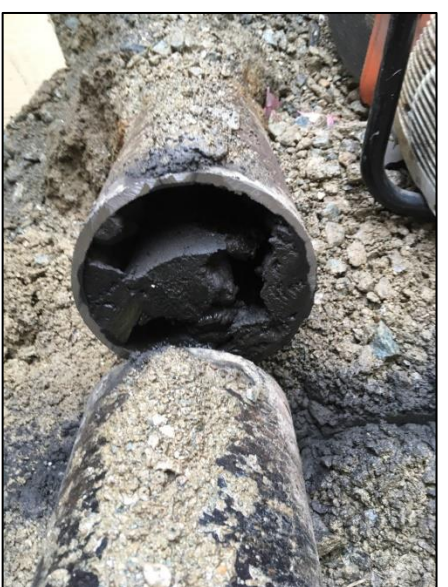
Pictures: Above left, cleaning and lining watermains in Sherbrooke, Quebec. Above right, initial internal condition of highly restricted, low flow watermain.