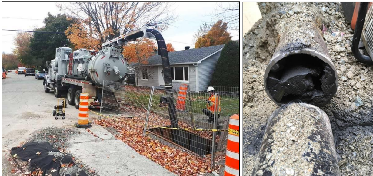
Pictures: Above left, cleaning and lining watermains in Sherbrooke, Quebec. Above right, initial internal condition of highly restricted, low flow watermain.

This project contained 500m of 150mm (6") ductile iron pipe on two residential streets. The pipes were highly tuberculated resulting in very low pressure, flow rates and chlorine residuals.