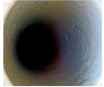
THE PHOTOS ABOVE, FROM LEFT, SHOW THE SAME WATER PIPE BEFORE CLEANING, AFTER A TOMAHAWK CLEANING AND AFTER THE TOMAHAWK BARRIER COATING. THE IMAGES ARE FROM THE JULY 2015 WATERLOO DEMO. CREWS WERE ABLE TO LINE 53 M OF PIPE IN 10 MINUTES.

tion is receptive to seeing new technologies in action.