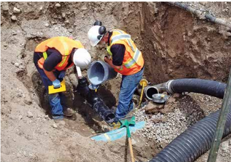
AFTER THE WATER LINE WAS CLEANED, CREWS BEGIN TO ADD THE TOMAHAWK BARRIER COATING.