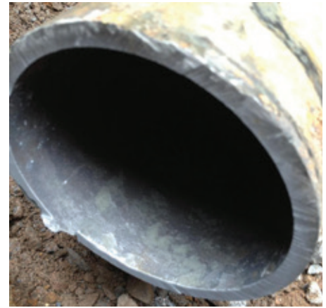
Left and centre: 6-inch, 357 foot CI water main prior to Tomahawk cleaning. Right: same pipe after cleaning.

reduction in the duration and amount of street level disruption.