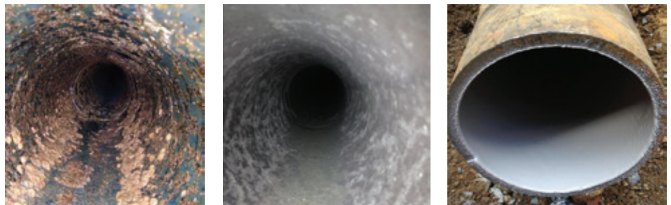
Left: 6-inch, 435 foot CI pre-cleaned pipe prior to Tomahawk cleaning, corrosion and bitumen seen. Centre: pipe after Tomahawk cleaning including removal of loose graphic corrosion, light gray sites. Right: after pipe lining by Trenchless Solutions.

On the following day, the 357 foot section was cleaned by Envirolitics in under 3 ½ hours. This pipe had not been pre-cleaned thus requiring both tuberculation and bitumen removal. This pipe was cleaned and lined under “same day return to service” conditions as no service bypass was in place. The water main was taken off line, cleaned, inspected, lined, flushed and reinstated by evening under a “boil water advisory”. The advantages of same day return to service include lower project cost and timing along with a significant